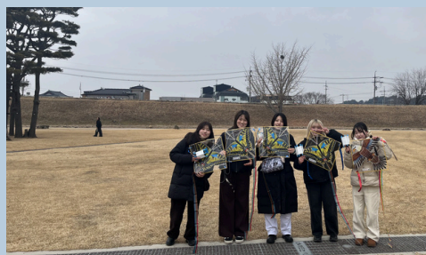
Students enjoying the field trip