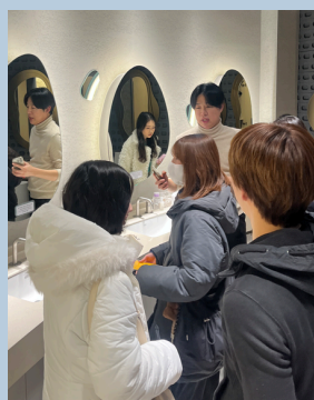
Tox N Fill