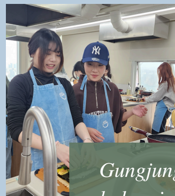
Gungjung bulgogi & kimbap