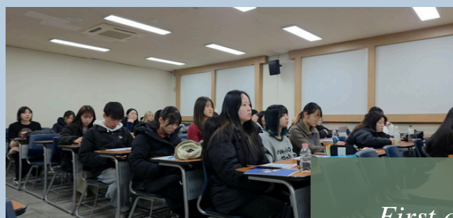
First day of classes

The K-arts and Pops classes will begin in week 2, where they explore Korean arts culture.