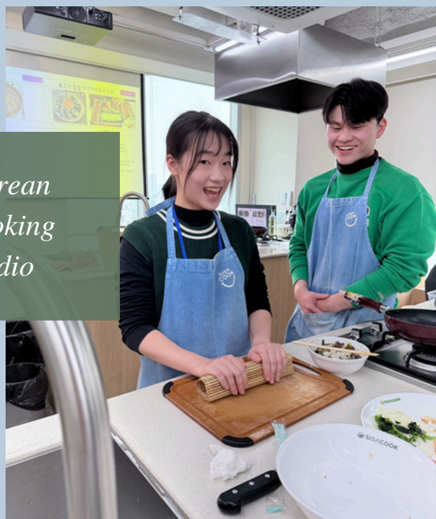
Korean cooking studio