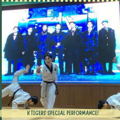
K TIGERS SPECIAL PERFORMANCE!

The ISS2 summer began with a meticulously planned orientation, where Konkuk's Korean buddies finally met Participants face-to-face!