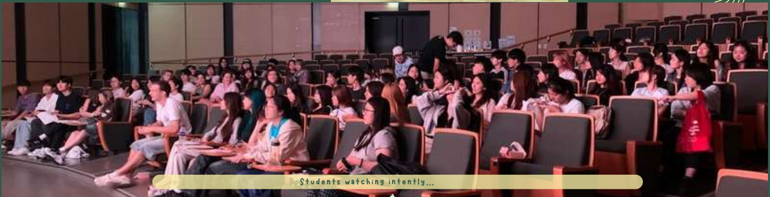
Students watching intently...