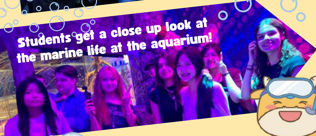
Students get a close up look at the marine life at the aquarium!