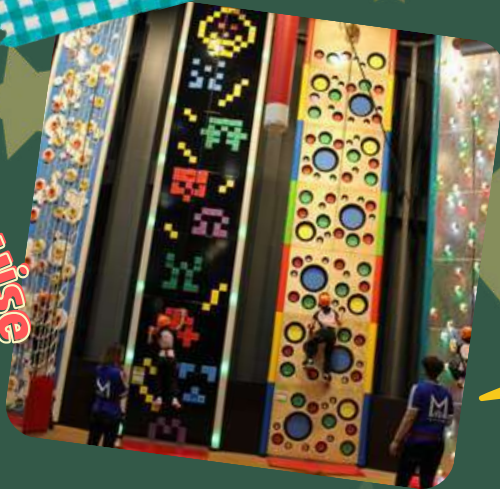
Hanam Starfield Smob